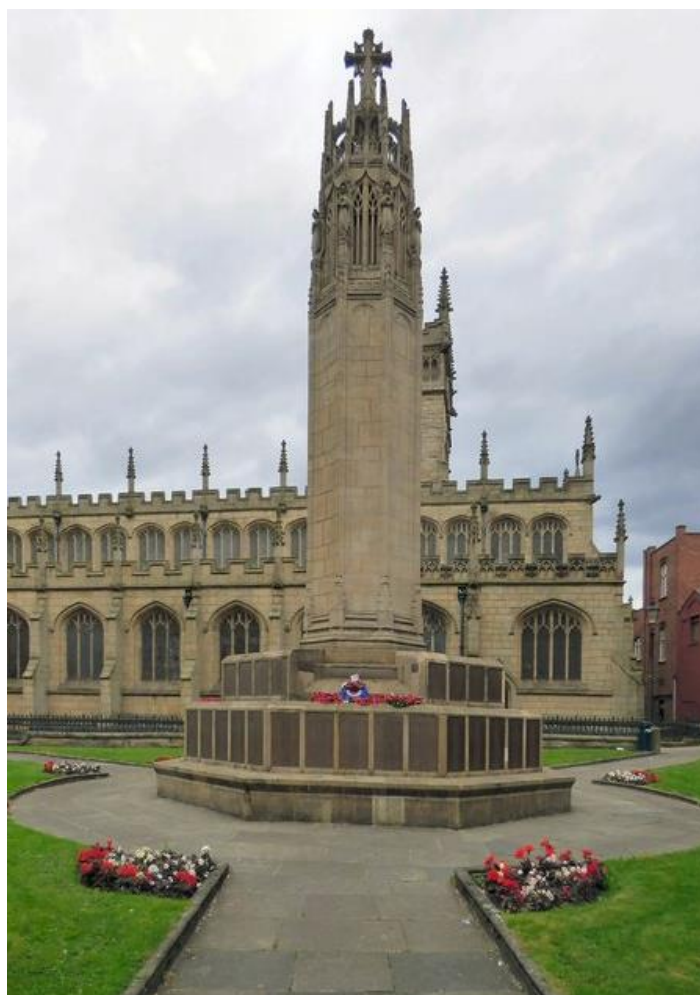
Wigan War Memorial