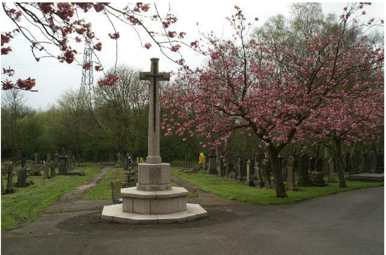
The Cross of Sacrifice - Wigan Cemetery