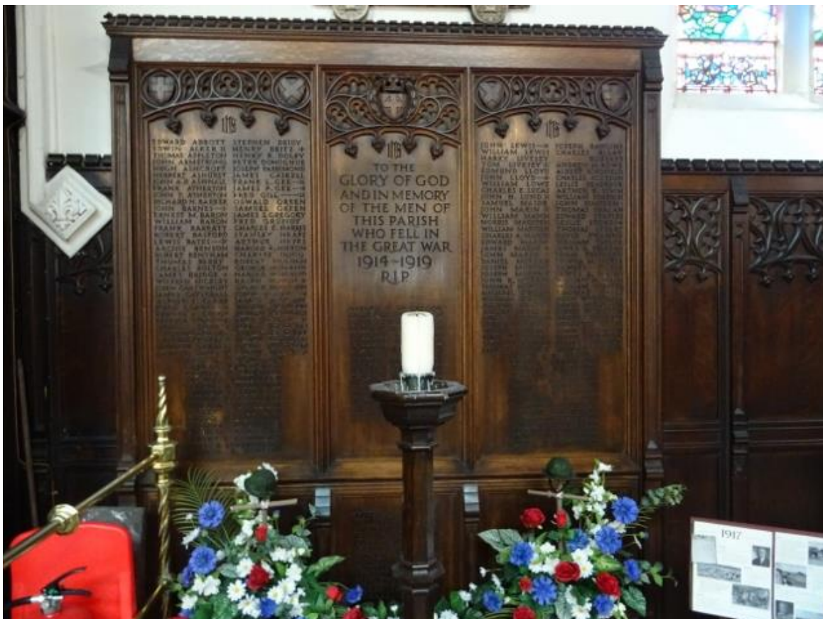
All Saints Church Roll of Honour, Bishopgate, Wigan